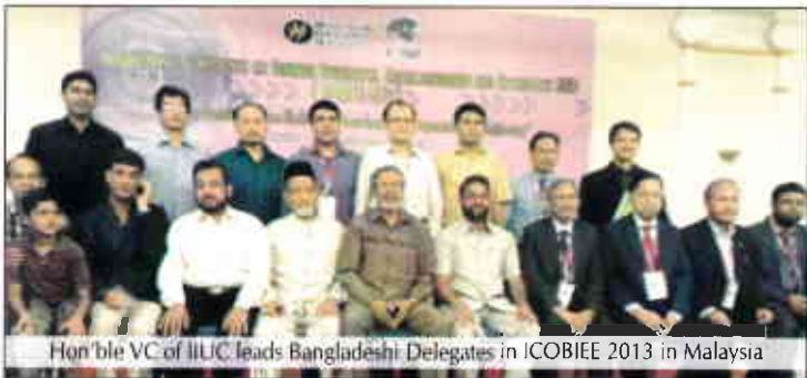
Hon'ble VC of IIUC leads Bangladeshi Delegates in ICOBIEE 2013 in Malaysia