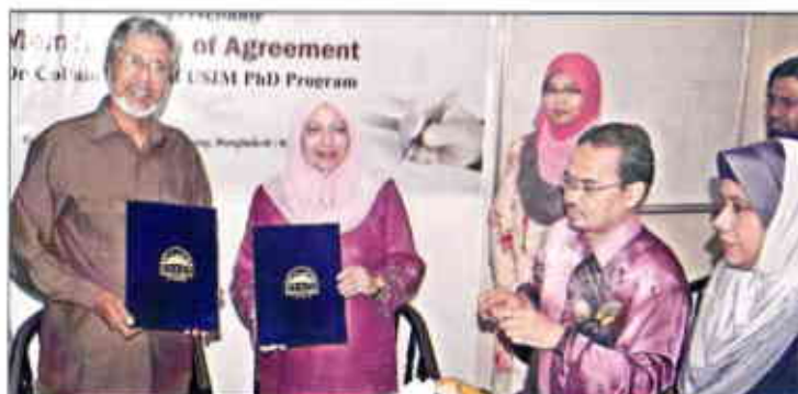
MoA signing ceremony on PhD Collaboration Program between USIM & IUC