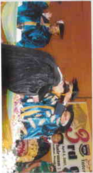
The then President and Chancellor of ILUC, Professor Dr. Iajuddin Ahmed distributing Convocation Awards.